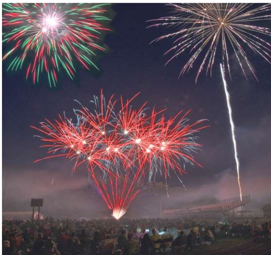
July Third Tunkhannock Fireworks