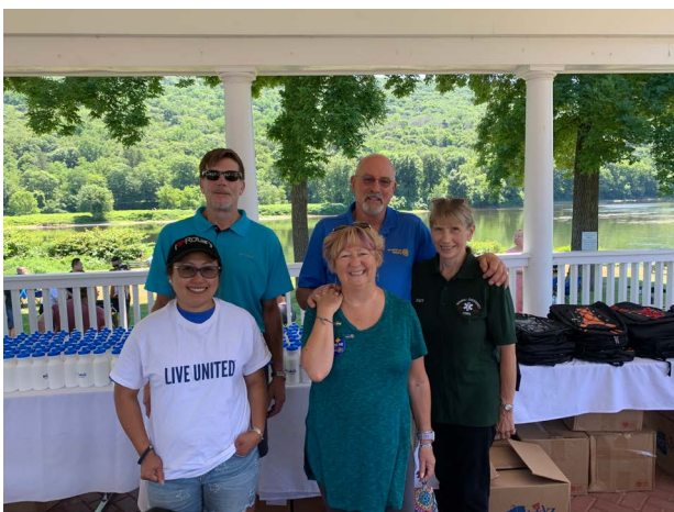
Rotarians volunteering with United Way handing out backpacks