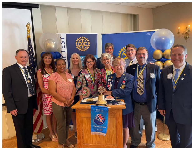
2022-23 New Board members