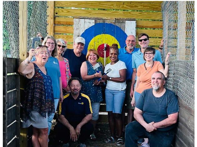
Some fellowship at Shawnee Inn's axe throwing