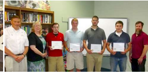
LTHS Senior Students of the Month 2014-2015 Pizza Lunch at the Lackawanna Trail High School