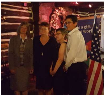
The new officers of the Rotary Club of Blakeslee