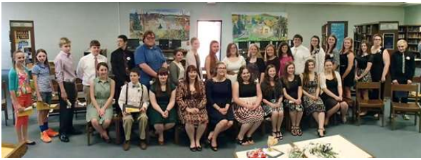
Lackawanna Trail High School Interact Club Induction Ceremony – May 2015