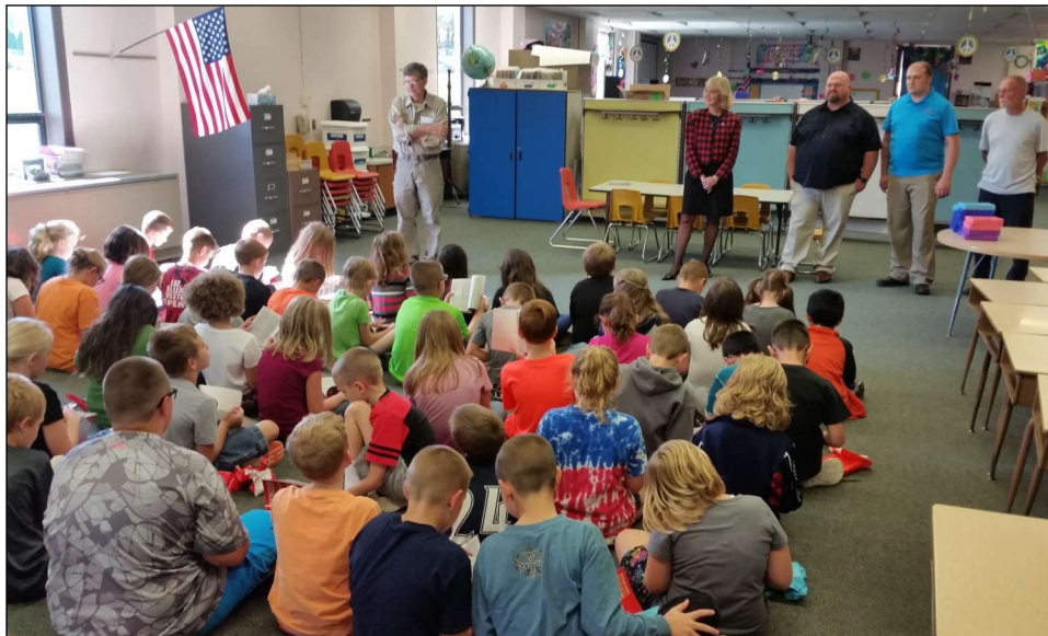
Third graders at the H. Austin Snyder Elementary School (above) and the Epiphany School (below) receive their dictionaries.

The Sayre Rotary Club recently distributed dictionaries to each third grade student in the Sayre Area School District. This is one of many community service projects undertaken by the club annually, and included H. A. Snyder Elementary School and Epiphany School. Shown are the students from both schools enjoying their first dictionary.