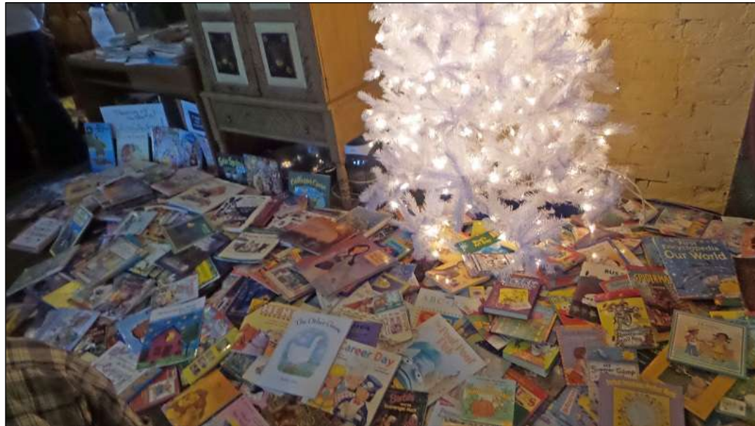
A mountain of books under the Christmas tree above Twig's Restaurant— and that's only part of the thousands gathered by Tunkhannock Rotarians.