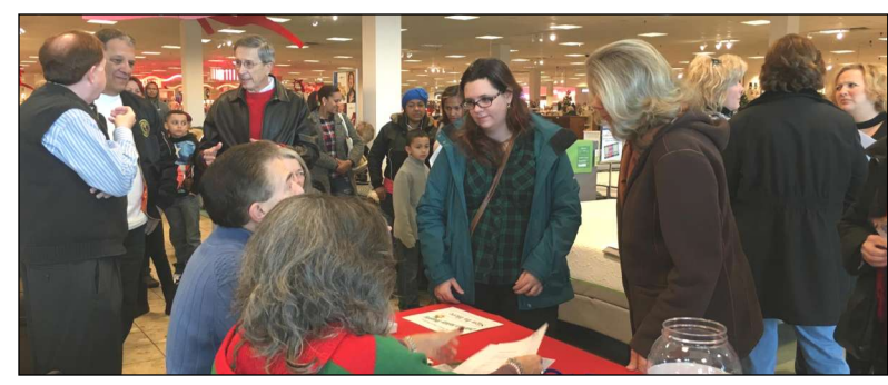
: Hazleton Rotary Club members/families/friends get ready to take some area children on a Holiday Shopping Spree at Boscovs on Sunday, December 4th.