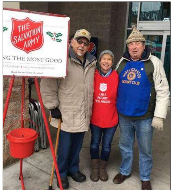
The North Scranton club braved the snow and cold to ring the bell for the Scranton Salvation Army on December 9th, 2017.