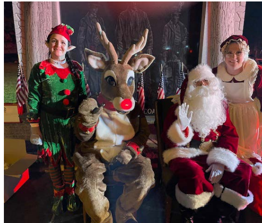
Santa's elf, Rudolph, Santa and Mrs Claus