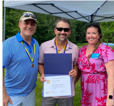
Outgoing Honesdale Rotary President receives a Paul Harris medal.