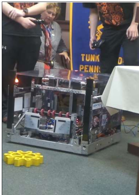
The robot moves in on the yellow gear above and then scoops it up (below). Mission accomplished!