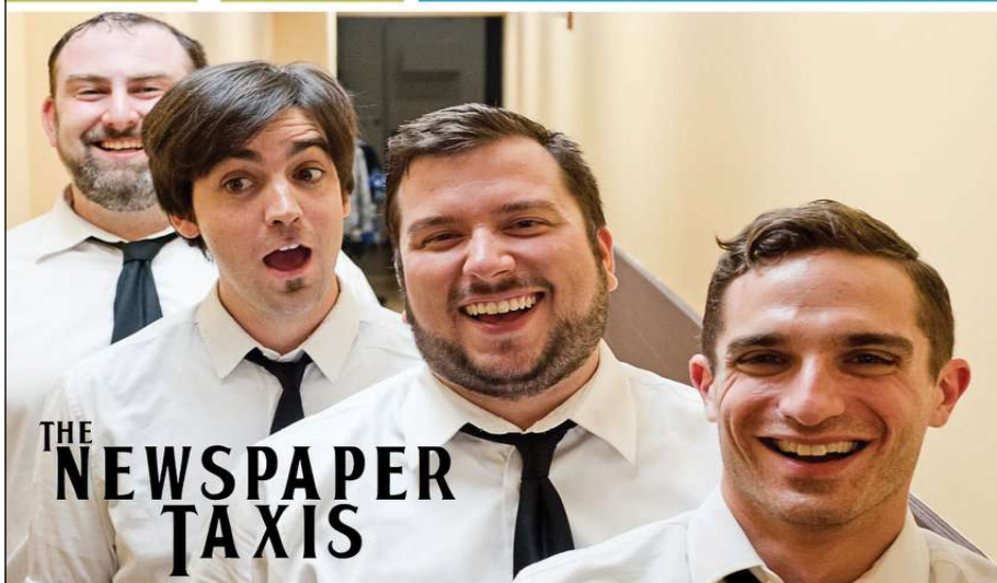
THE NEWSPAPER TAXIS

Food Festival with a taste from the restaurants of Barrett & Paradise