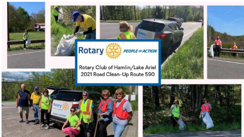
Rotary PEOPLE OF ACTION Rotary Club of Hamlin/Lake Ariel 2021 Road Clean-Up Route 590

One May 1th, the Rotary Club of Hamlin/Lake Ariel completed their annual roadside cleanup along Route 59- in Hamlin. A big heartfelt "Thank You!" is in order for all our members and community members that came out this weekend to help with our Road Clean-up on Route 590!