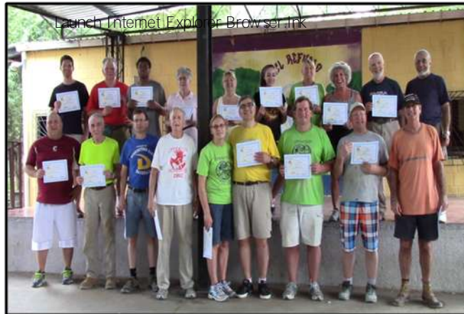
Part of the twenty-eight 2016 Operation Honduras Volunteers

Also in February, a team of 7410 Rotarians accompanied the Operation