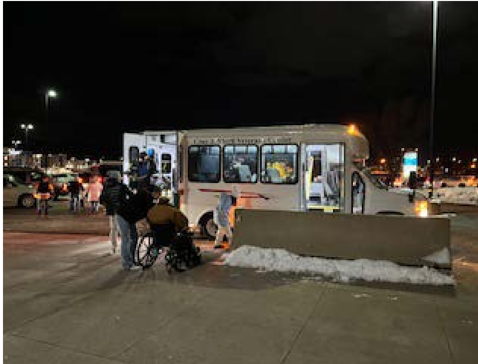
Gino Merli Veterans Home delivering 10 resident Veterans thanks to a Rotarian donating tickets