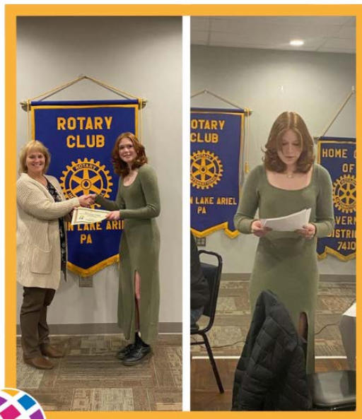
2021/2022 Essay Contest "How can you serve others to change lives?"