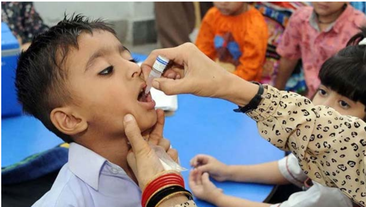
A lady health worker administers polio drops to a child during a polio eradication campaign in Hyderabad on April 29, 2024.

The writer is a humanitarian, industrialist and diplomat who serves as the chairman of the National Polio Plus Committee, Pakistan for Rotary International.