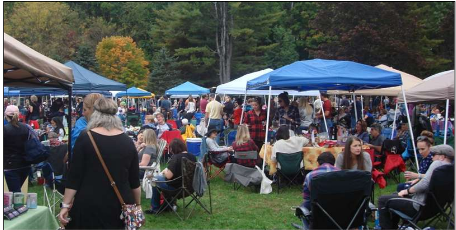
Views of Wine Festival from ground level (above) and overhead (below).