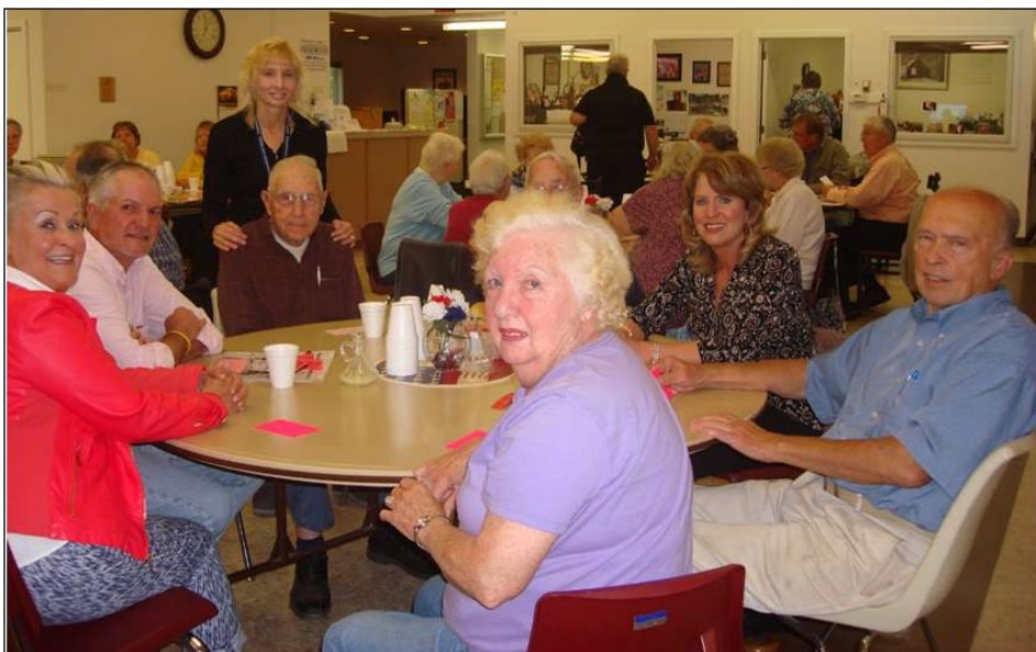
Tunkhannock Rotarians held a weekly October at the Wyoming Active Adult Center where they received a big thank you for their efforts there.