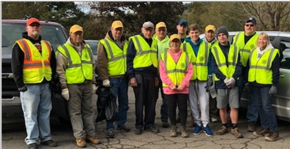
Tunkhannock Rotarians, Family and Exchange Students Participating in Fall Roadside Cleanup

Although much of the material found is garbage and debris, other