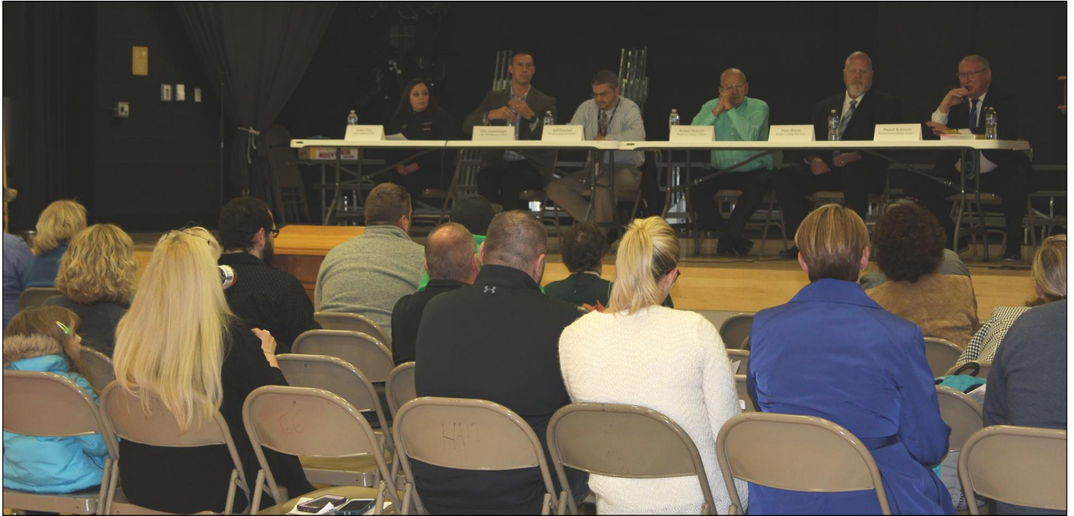
A panel of professionals educate an audience on virtually every aspect of the heroin and opioid crisis at a forum hosted by the Hamlin Rotary Club at Lake Elementary.