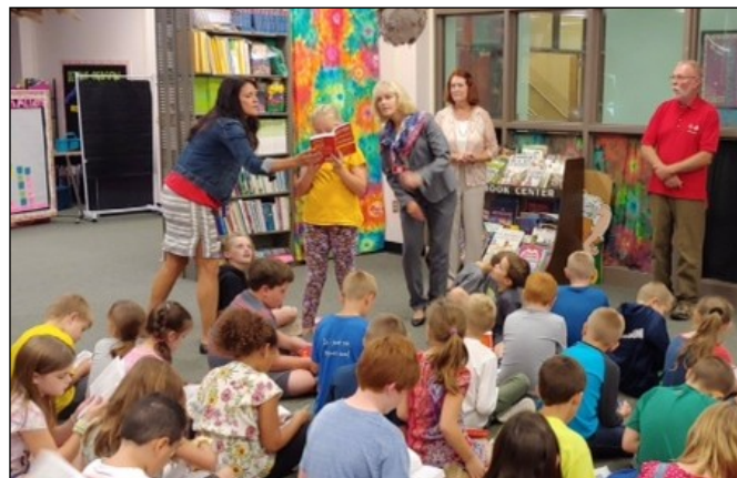
Distributing dictionaries at Snyder Elementary School (above) and the Epiphany School below.

The other Areas are Disease Prevention and Treatment, Peace and Conflict Prevention/Resolution, Water and Sanitation, Maternal and Child Health, and Economic and Community Development. Rotary recognizes that basic literacy is a pre-condition to the development of peace..