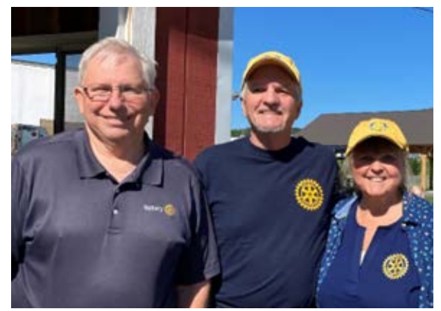
3 of the many Rotarians who worked the Wyoming County Fair

In lieu of a Rotary meeting on Thursday Aug 31, members of Tunkhannock Rotary worked the ticket gates and parking lots at the Wyoming County Fair.