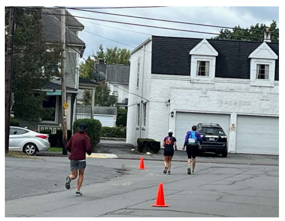
A particularly moving picture and inspiring moment – a blind and deaf runner assisted by a companion runner, Rotarians making it safe for all runners with all capabilities.