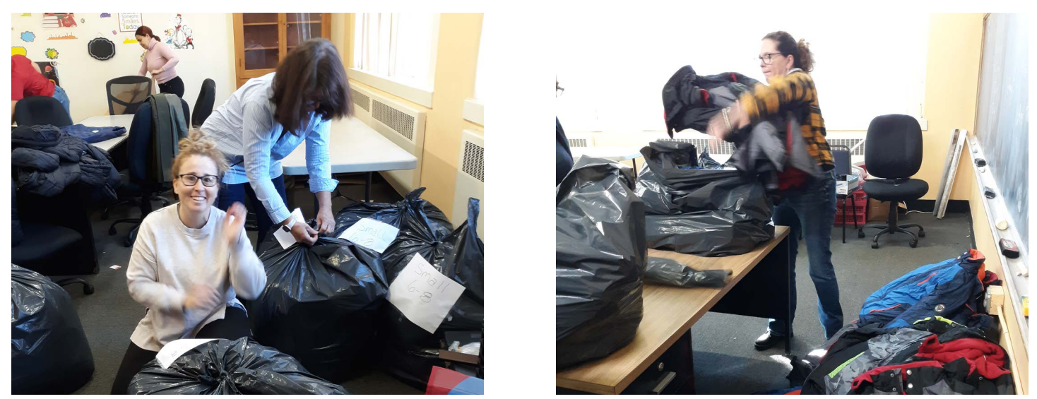
Members of Hazleton Rotary got together to sort and pack Kidz Coatz for school delivery later in the year.