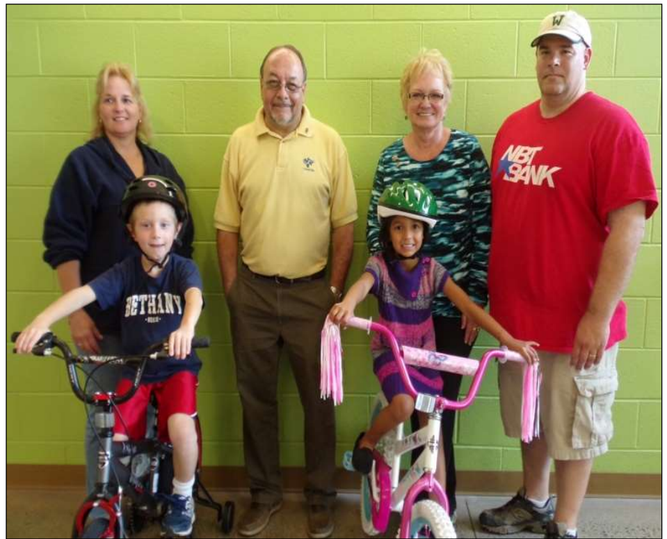
Two young bike winners pose with Rotarians at the first annual Safe Kids Fair—a public service community event for residents of Wayne County.