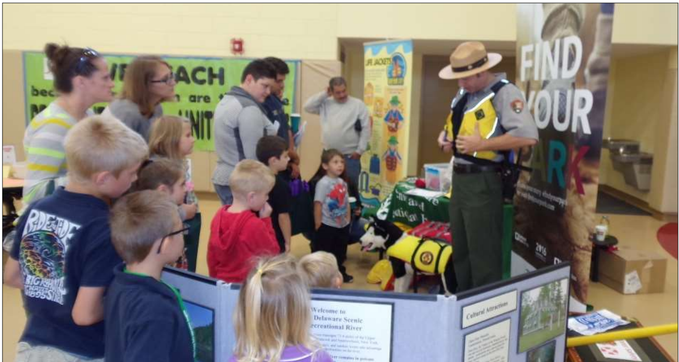
Their first Safe Kids Fair in Hamlin was a big success. Shown in photos from above (clockwise) are a safety demonstration by the National Park Service; a bike helmet fitting, and activity in the school gym.