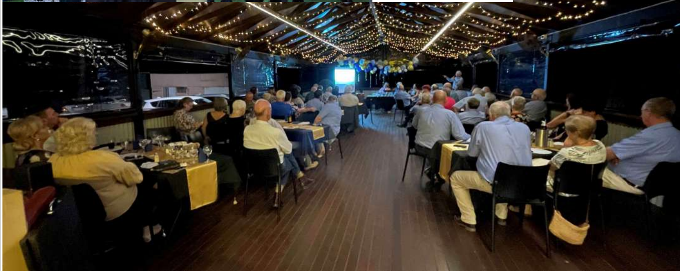
Below: The Combined Services Club Dinner at Harrisville,