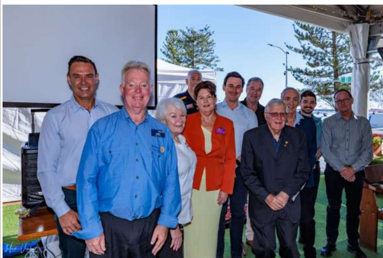
Left: Official hand-over of the X-Ray Unit for Pentecost Island, Vanuatu, with various dignitaries, councillors and presidents

Another busy month with District meetings and special occasions including a combined Service Club Meeting at Harrisville with The RC of Fassifern Valley and the RC of Boonah, MUNA held at Tweed Heads Civic Centre, Pentecost Island Project at Café Catalina Southport, RC of Banora Tweed Volunteer Recognition evening. Congratulations to all for your outstanding contributions to your communities.