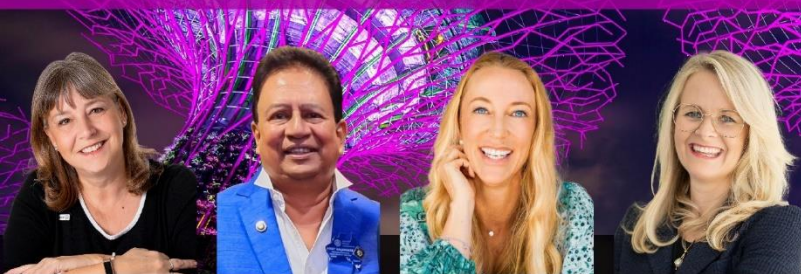
Meet Our Panel

MONDAY 27 MAY 1PM - 2.30PM Marina Bay Sands Hotel Convention Centre