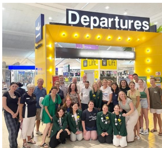
Our Europe bound students are farewelled at Brisbane International Airport by the youth exchange committee and their families.