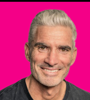
CRAIG FOSTER AM Former Soccerroo, Human rights activist