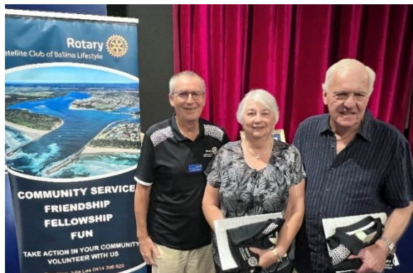
Satellite Club of Ballina Lifestyle