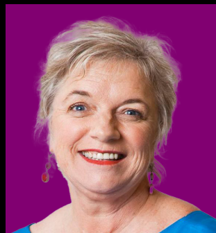
FAY JACKSON Emeritus Deputy Commissioner Mental Health Comm. NSW