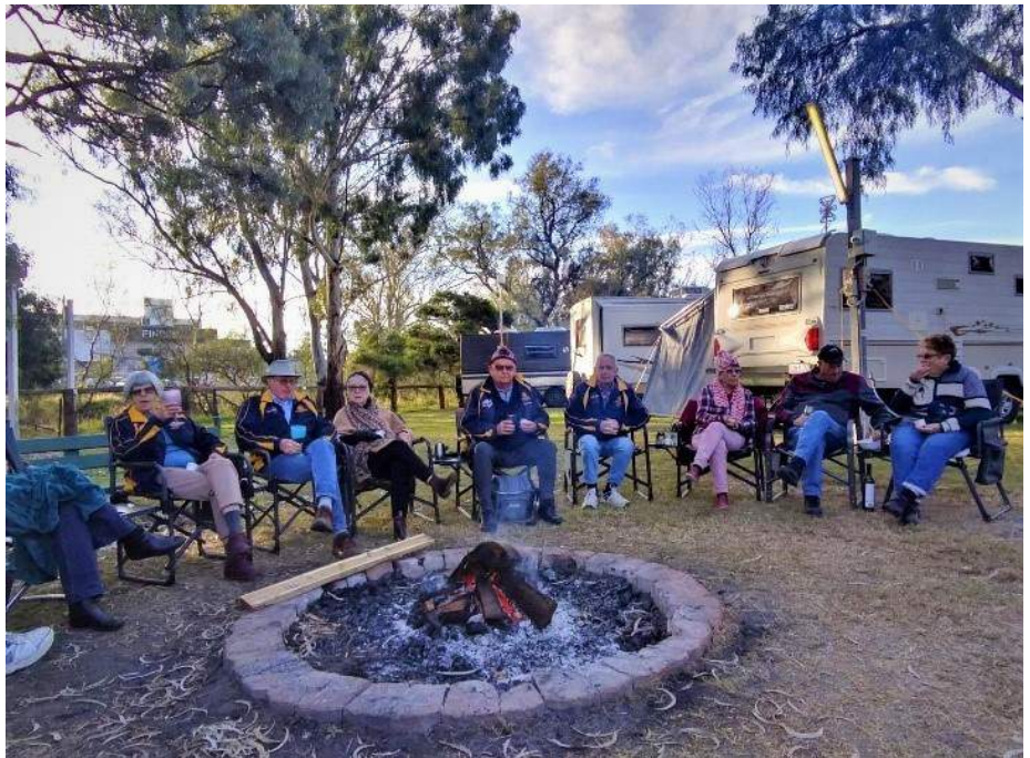
Gathering around the camp fire at the end of the day

RVFR Members participate in 'musters' in the great outdoors, visit interesting places, enjoy fellowship with friends, participate in pleasant activities, partake in happy hours and above all - have fun!