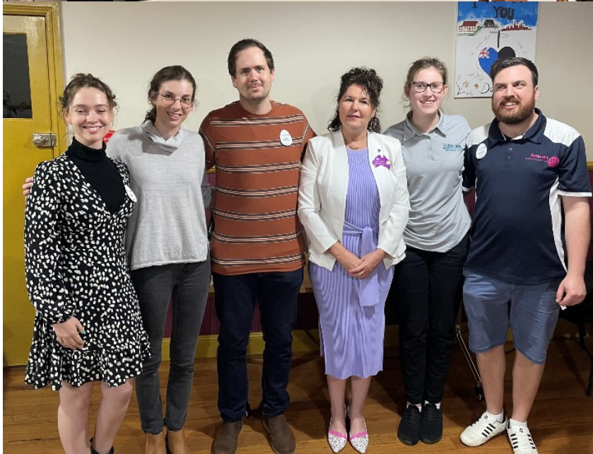
Rotaract Club of Scenic Rim