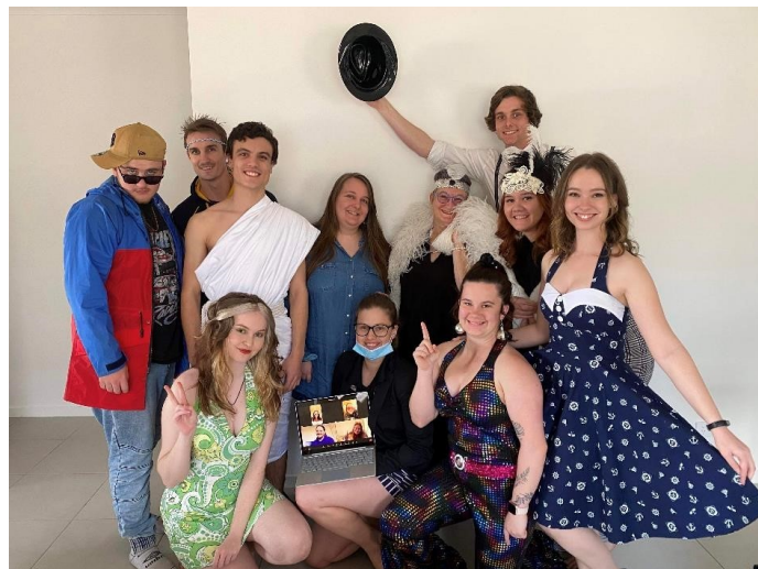
Real serious stuff, huh! The RYLA team had a bit of a dress-up - "Your favorite decade". From Roman times to Zoom outfit: (top in blazer, bottom in pyjamas...

The team is also running a trivia night November 26 th . An event will be created on Facebook via the YLA9640 Facebook page, so be on the lookout for that!