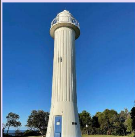
Click on image for welcome video