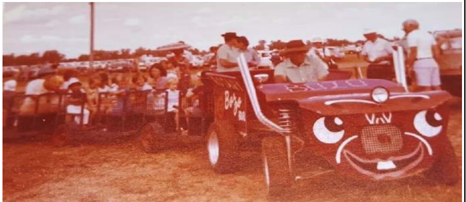
The original Bozo Bus

The Bozo Bus of today looks very different to the original. The original Bozo Bus looked fairly cool but has evolved over the years, but the intent remains the same – to bring joy and a smile to those who ride the Bozo Bus!