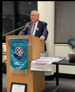
Ballina-on-Richmond and Griffith Gold Coast Changeovers