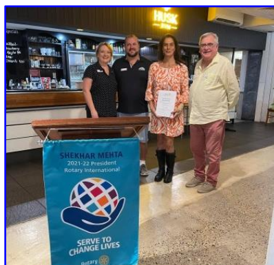
Mt. Warning AM