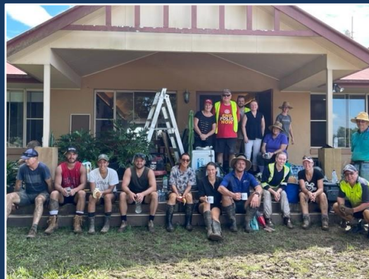
The clean-up team