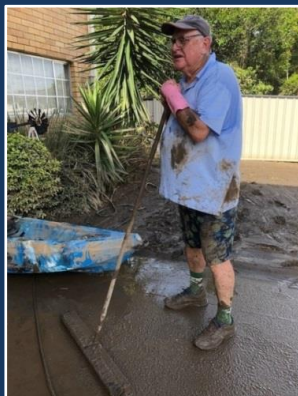
Helping at Tumbulgum