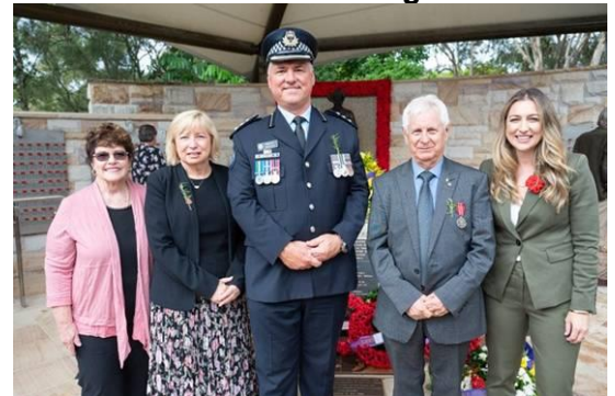
Three Rotarians and two friends of Rotary, at the Currumbin RSL ANZAC Day service.