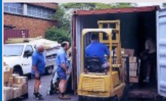
LEFT , Loading at Wacol

In 2000 DIK moved to the Wacol Special Hospital precinct till 2008 when the Government of the day decided it wanted to demolish the building.