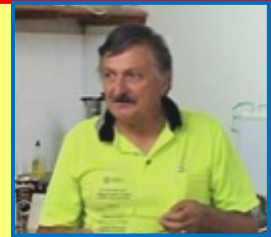
Col holds the CILTA National Trophy won by NR-DIK in 2017