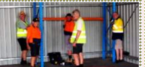
Up went the pallet racking and in came the equipment required to restart DIK

POSITIONS VACANT Gardeners, cleaners, storemen, forklift drivers, packers, handymen and general hands needed to join the regular team or attend on a casual basis Thursdays 8.00 AM to Noon Local Community Volunteers are welcome to attend