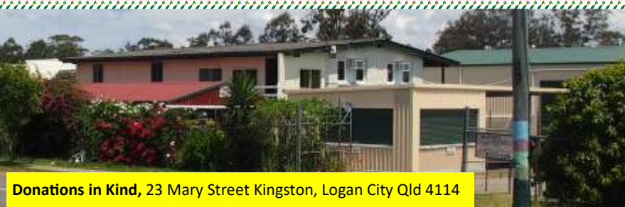
Donations in Kind, 23 Mary Street Kingston, Logan City Qld 4114