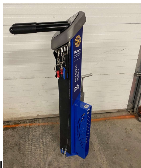
2 Bicycle Repair Stations - Millennium Trail