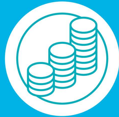
COMMUNITY ECONOMIC DEVELOPMENT