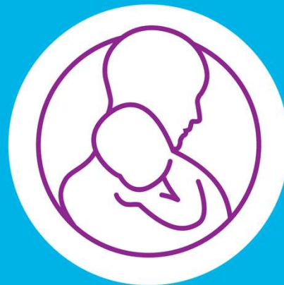
MATERNAL AND CHILD HEALTH