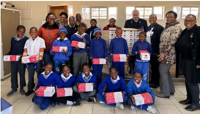
The School Management, Rotarians and some very happy learners.

The Rotary Club of Chatsworth are also extremely busy in their community. We were shown three of their projects, two of which are really worth mentioning. During the floods of 2022, an area known as 7 Tanks was damaged. This area is the home of a number of Herb Farmers and their homes and crops were totally destroyed by the flooding. With the help of twinning Rotary Clubs and the local Hardware Store, they were able to restore the Community.