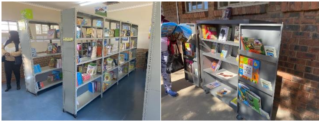
Two of the new library book racks and the mobile unit.

Rotary Club of Bloemfontein Thabure have adopted Morafe School and have used funds and partnerships with local businesses to upgrade and stock the school library, which includes a mobile unit to take books to the Foundation Phase of the School, and this year partnered with Spar to provide 50 pair of shoes to the disadvantaged learners.