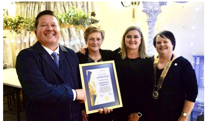
The Management from the Bothaville Pharmacy and their Certificate.