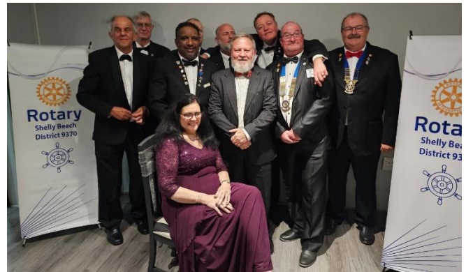
The Rotarians in attendance at the Shelley Beach Awards Dinner. Spot the odd one out! Okay, I'm just stirring, again! 😊