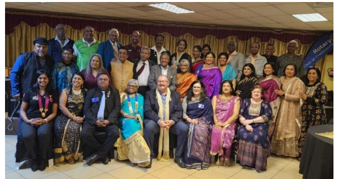
Members and Ann's of the Chatsworth Club.