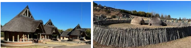
Some of the traditional homes on display in the Village.