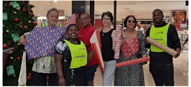
Members from the RC of PE South & West assisting with the present wrapping service offered at the Tree of Joy.