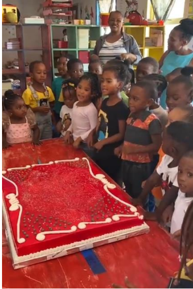
It's not Christmas if there is no cake!