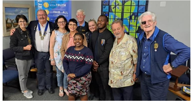
Team photo with the RC of PE South.