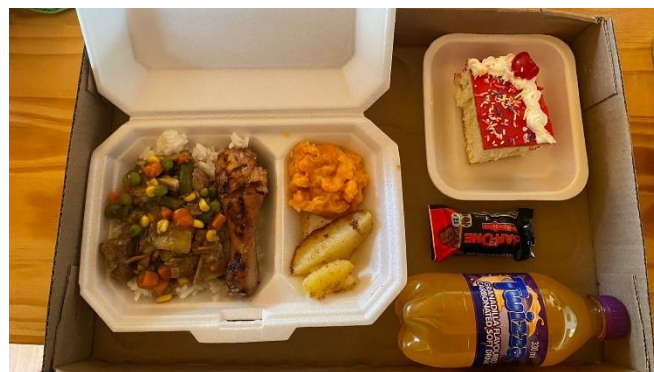
The delicious home cooked meal ready for delivery.

Each meal contained lamb stew, a chicken drumstick, pumpkin, rice, and roast potatoes. Everyone also received a slice of cake, a chocolate and a cooldrink.