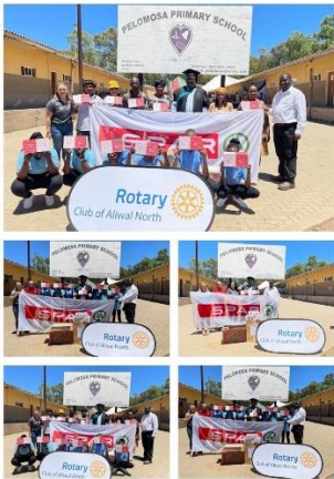
Two more schools who benefitted from the Shoe Project.