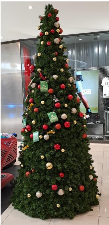
The rather bare Tree of Joy as the project is wrapped up.