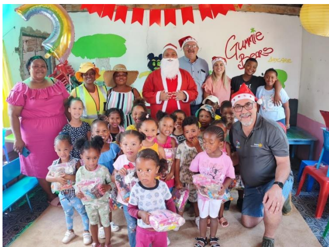
The kids from Gummy Bears with Santa and some of the Rotarians.

I was also able to attend their annual Christmas with Santa at 4 Early Childhood Development centres where the kids each get given a gift, cooldrink and some cake.