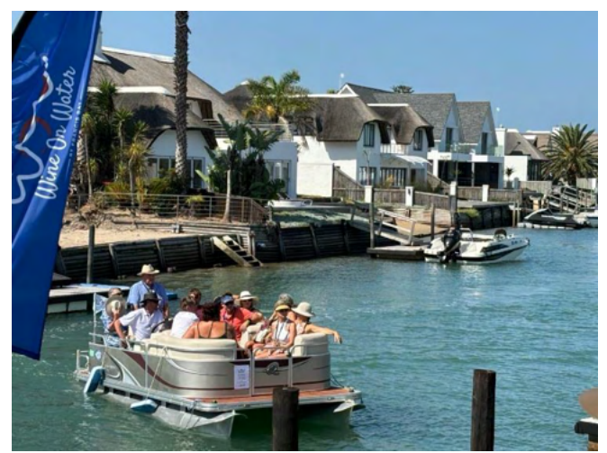
One of the many barges that transferred the patrons between the tasting stations located on the canals of St Francis.