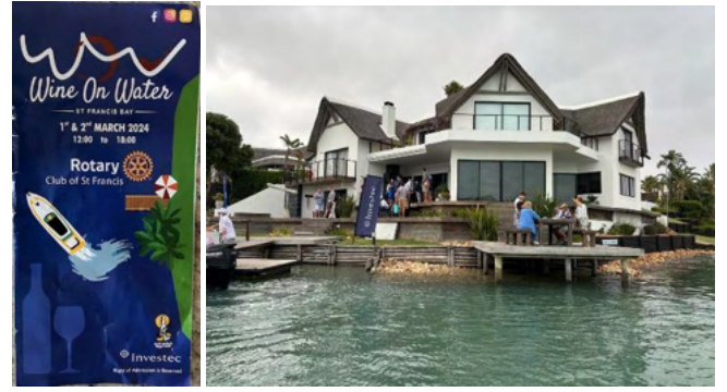
Wine on Water Programme and one of the tasting stations.

My final trip of the month was back to the Eastern Cape where I visited the Rotary Clubs of Port Elizabeth and St Francis. The highlight of this trip was the Wine on Water Festival hosted by St Francis. This year, 25 different Wine Estates had their wines available for tasting. This Festival is extremely popular, and the tickets were sold out within the first 10 minutes of going on sale. More detail to follow in my next edition.