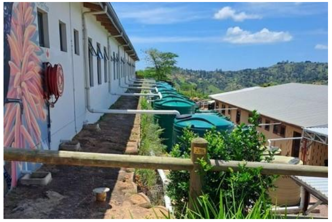
Some of the water tanks installed at Philakade ensuring continuous water supply to the facility. A borehole has also recently been installed.

My visit to the Rotary Club of Durban Bay included the viewing of two Global Grant Projects in the valley of 1000 Hills. The first was a visit to Philakade Care Home where the Club has assisted with the installation of Water and Sanitation equipment.