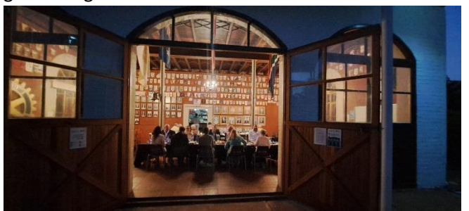
The dinner in full swing as seen from the outside!