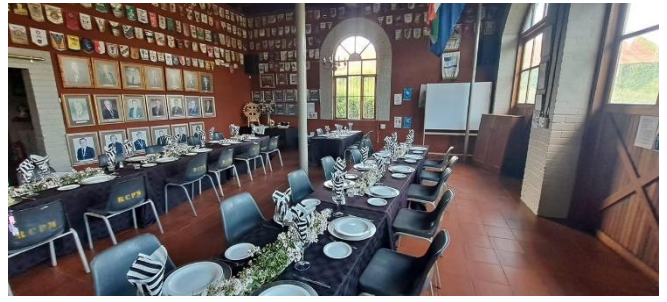
Potch-Mooi Clubhouse set and ready for the Rotarians.

Our penultimate stop was the Rotary Clubs of Potchefstroom and Potchefstroom Mooi. Again, we received feedback of the wonderful work our Clubs are doing across the District uplifting communities, providing services and most importantly, creating hope.