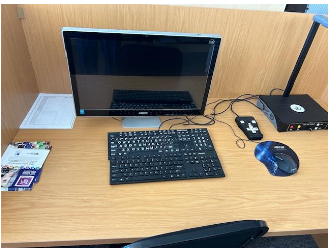
The Braille Workstation which is available at the Sea Vista Community Library in St Francis.