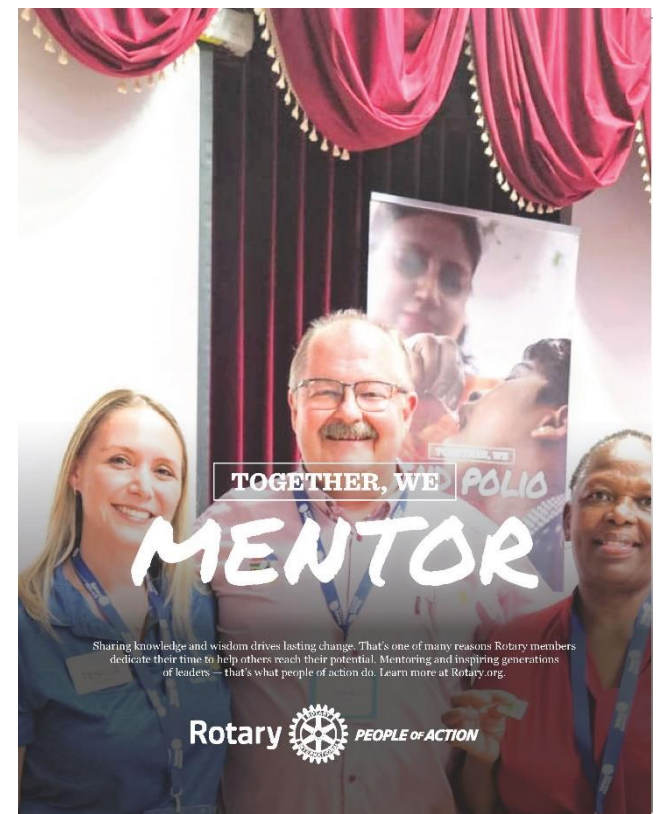
Our latest People of Action Poster created following POETS 2024. With me in the poster, are two of our newest members in District 9370.