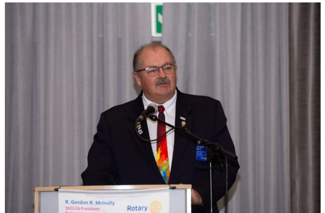
Addressing the Gala Luncheon with an update on District 9370.