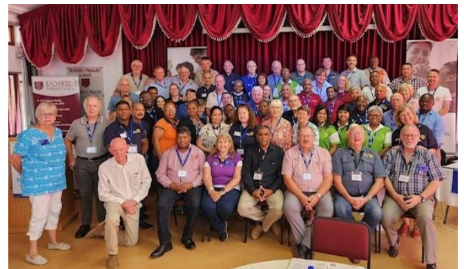
Group photo of the Durban Delegates following Session 1.

Our third and final Assistant Governor and President & Officers Elect Training Seminar took place in Durban from 15 to 17 March 2024. Once again, the event was well supported with approximately 70 delegates in total.