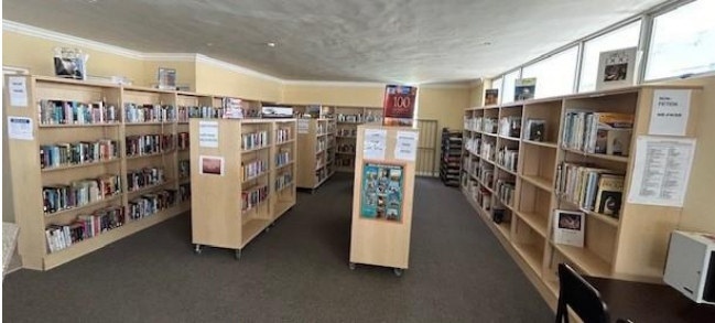
The adult section of the library which includes 10 computer workstations and a braille computer.

For a Club that was only Chartered in 2019, they are really Creating Hope in their Community. Besides being involved with the upgrading of the local Fire Station, a vitally important service in their community, they have upgraded the local Sea Vista Community Hall, Library and are very involved with the Community Clinic.