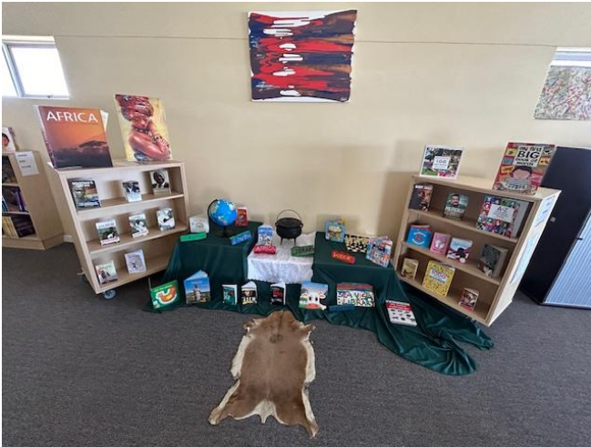
The display area which is currently promoting South African Culture.

The second floor of the library hosts the children's section which includes a reading area, computer workstation, display area and bookshelves.