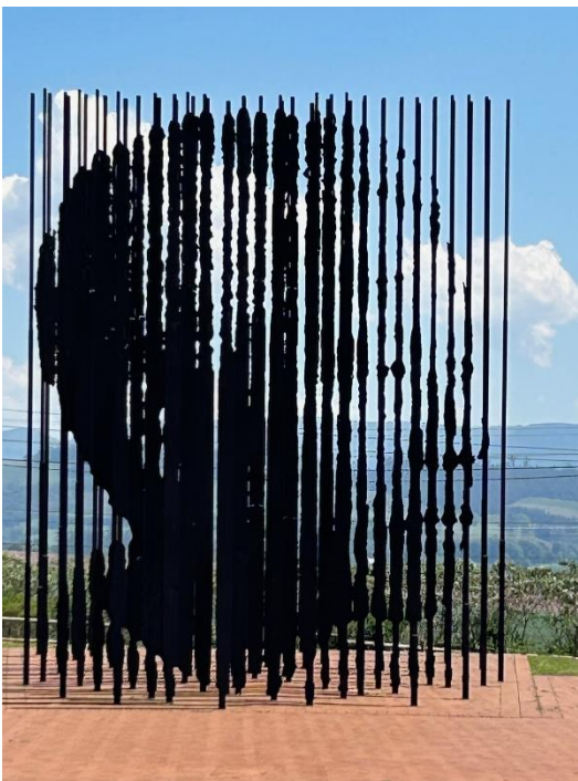
Nelson Mandela capture site near Howick in KZN.