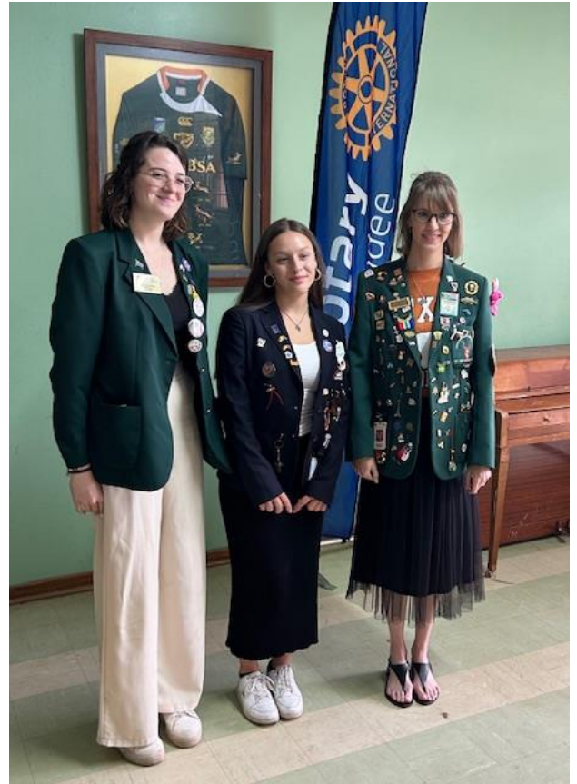
Past outgoing and present incoming Youth Exchange Students attending the Dundee 70 th celebrations.