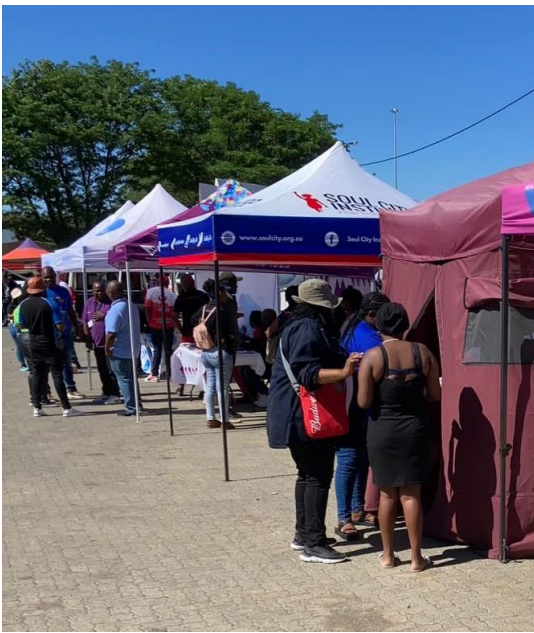
RFHA Day launch in Bloemfontein.