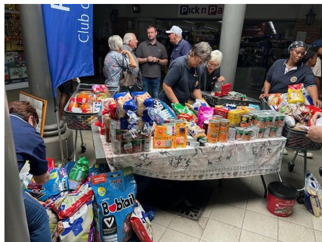
The donation table at the very successful R2-00 Project.

The weekend kicked off with the official DG Club visit and dinner on the Friday evening. Saturday morning saw the Club hosting a very successful R2-00 project at the local Pick 'n Pay where 7 trolleys of food were collected for 5 various beneficiaries in Dundee.