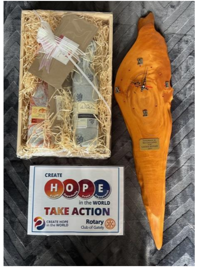
Another beautiful gift: a handmade clock from McClelland's and two fantastic bottles of wine from RC of Gately.