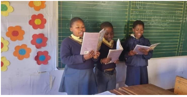
Grade 3 Learners busy with a reading presentation.

Once again, I was left speechless at the wonderful work we as Rotarians do in our communities. During the week in East London I was shown some awesome projects which we are involved with, ranging from the McClelland Adult Centre For Intellectually Impaired, where Rotary has been involved with the supply of water tanks and plumbing, to the Fort Grey Primary School where Rotary donated books and a container in which a library and Chess Club has been established, to the Guardians of Hope Centre for Vulnerable Children where Rotary assists, not only with funding, but also with manpower with the caring of abandoned and vulnerable young children aged between new born and 4 years of age.