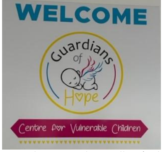
A very special project in East London supported by RC of Gately.