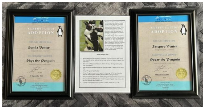
Our official Adoption Certificates with a photo of our little ones. (In case you were wondering, Skye, the female, is the one with her mouth open!) A wonderful and unique gift that we appreciate endlessly.