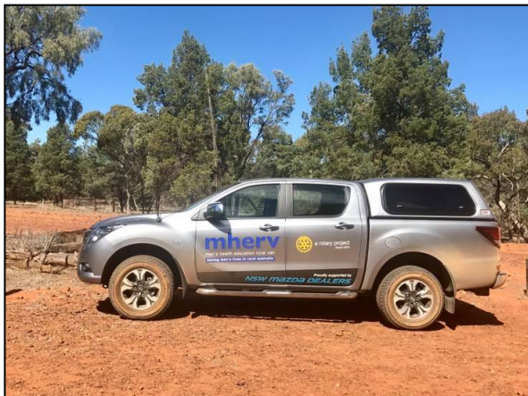
mherv BT-50 near Cobar 10th September 2017

Aside from capital items and sponsorships in kind, the cost of the tour so far has been $56,915. An average of $59 per person tested. (This calculation includes some incidental costs and minor donations). A small grant from Cobar's New-Gold Mine was also gratefully accepted.