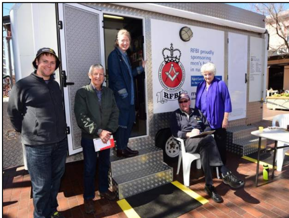
mherv in Dubbo 8th and 9th October 2017