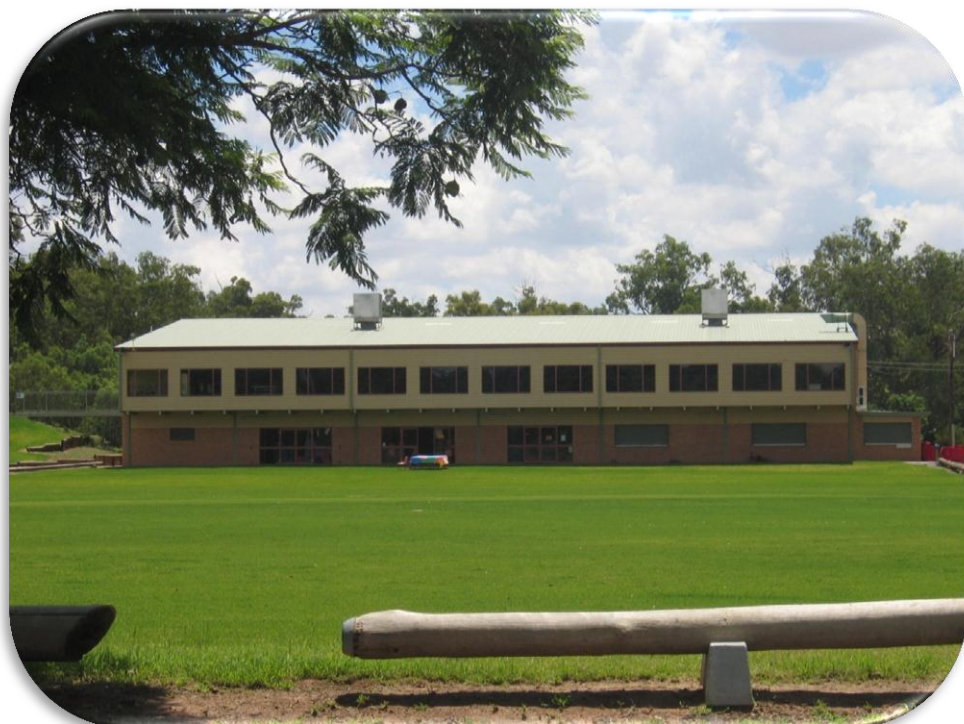
Conference venue – Warren Sporting and Cultural Centre