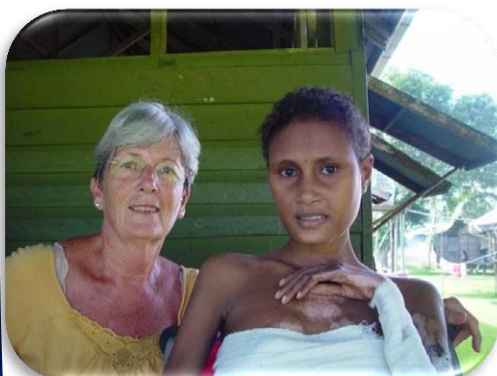
In PNG, April 2006