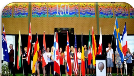
Exchange students with the final parade of flags

Conclusion – DG Janette may be a bit crazy, but what fun for all! District 9670 Conference was certainly different in 2012.