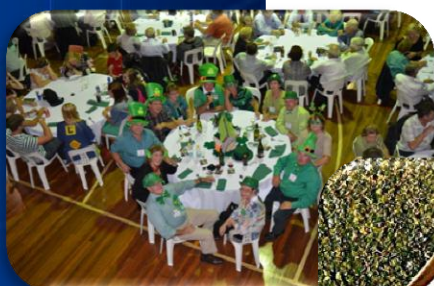
A sea of green at the dinner