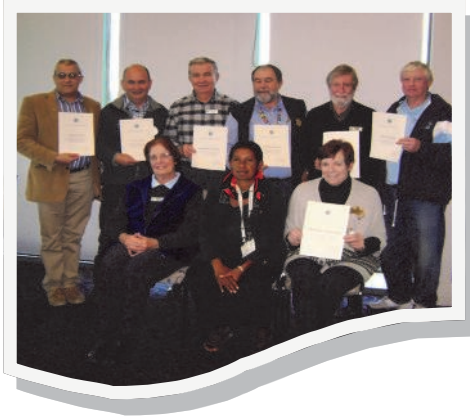
Above: The proud graduates! District 9670's newest RLI bunch proudly display their certificates of completion. Well done team.