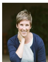
Pip Job Resilience of rural women