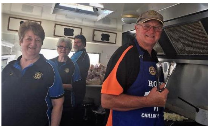
Feeding the crowd on reveal day.