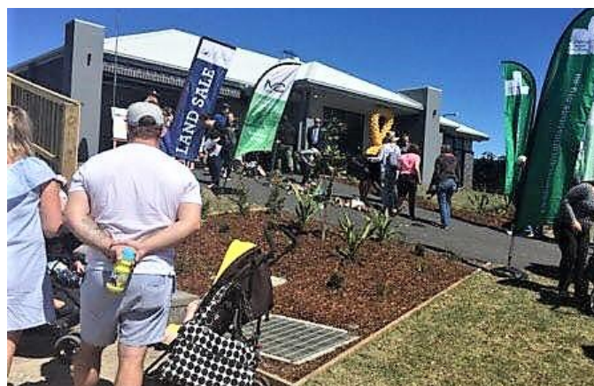
A lot of community interest in the finished house