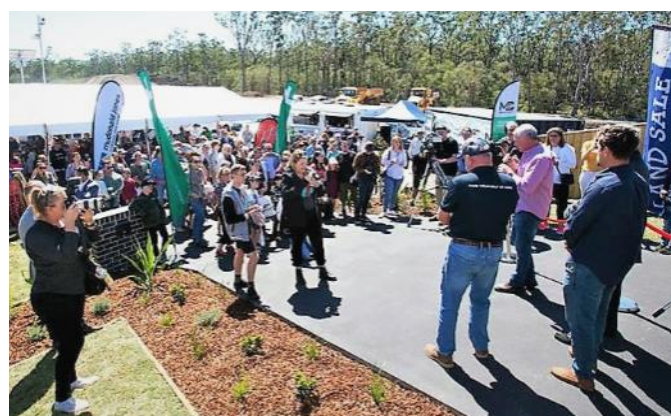
Part of the crowd attending the reveal day on 16 September

"The House Built with Love" Build for a Cure 2018