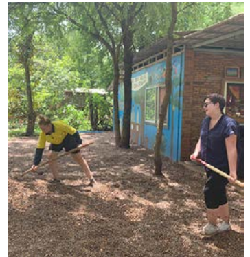
Shovelling gravel ...and the girls are right into it