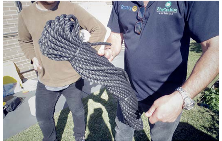
Did you know this ShelterBox rope can become three times its original length?