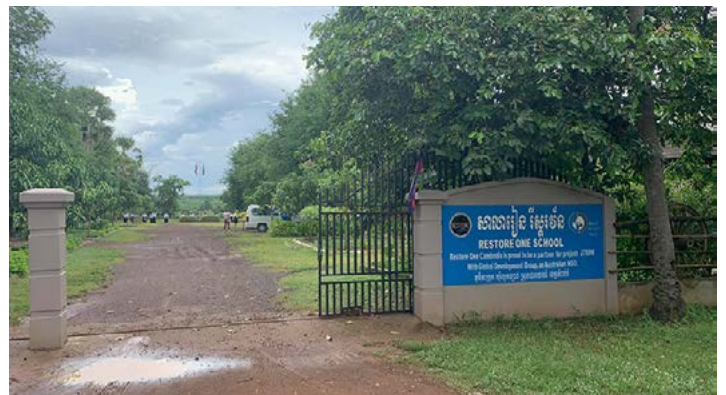
The Restore One school entrance