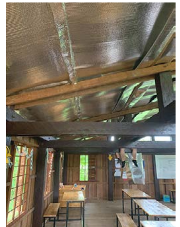
Installing insulation - who owns those legs?!

https://restore-one-gdg-j789n.raisely.com/rotaract