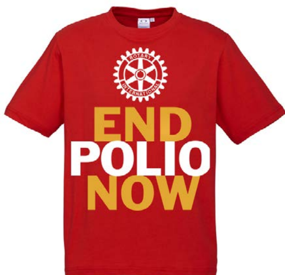
"End Polio Now" – Red T-Shirts – available at RDU Supplies http://rdusupplies.com.au/end-polio-now-shirt/