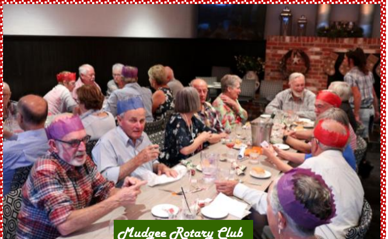
Mudgee Rotary Club