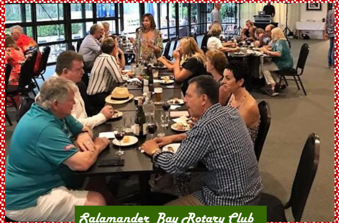
Salamander Bay Rotary Club