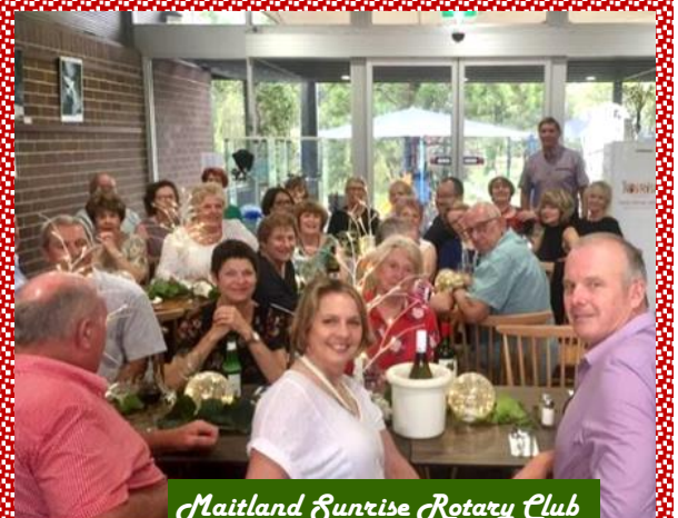
Maitland Sunrise Rotary Club