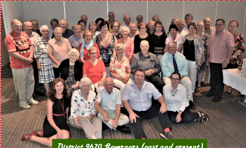
District 9670 Governors (past and present)