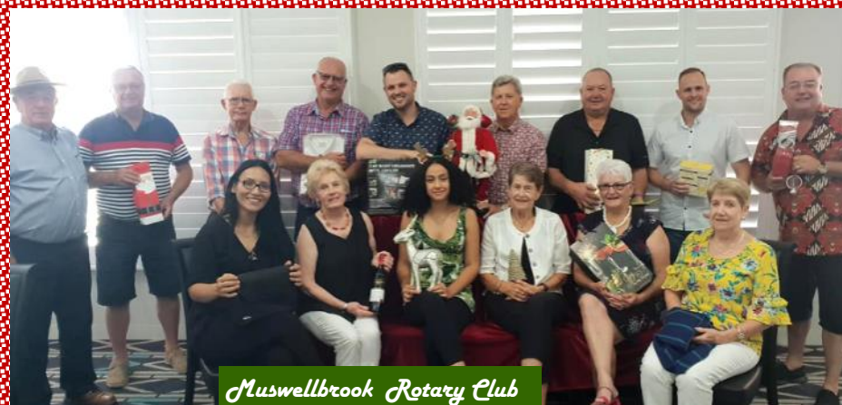
Muswellbrook Rotary Club