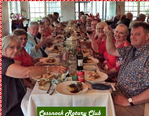
Lessnock Rotary Club