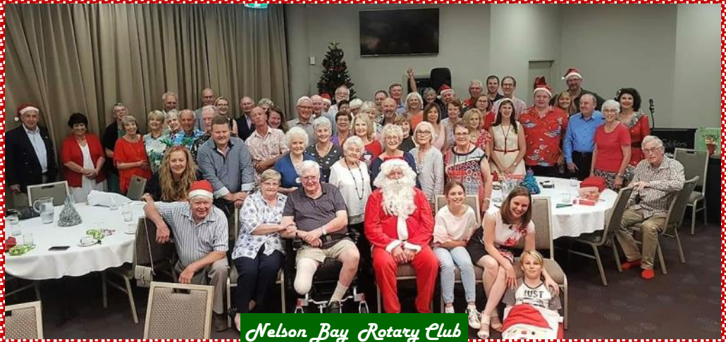
Nelson Bay Rotary Club

Great to see our Clubs taking ‘time-out’ to celebrate their fellowship and achievements over the past year.