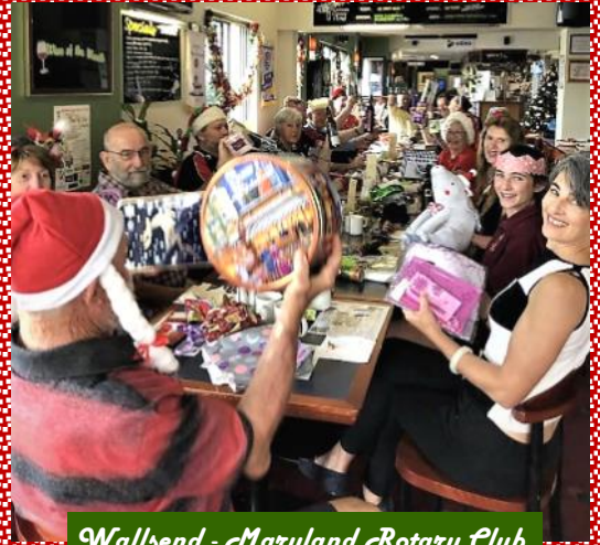
Wallsend - Maryland Rotary Club