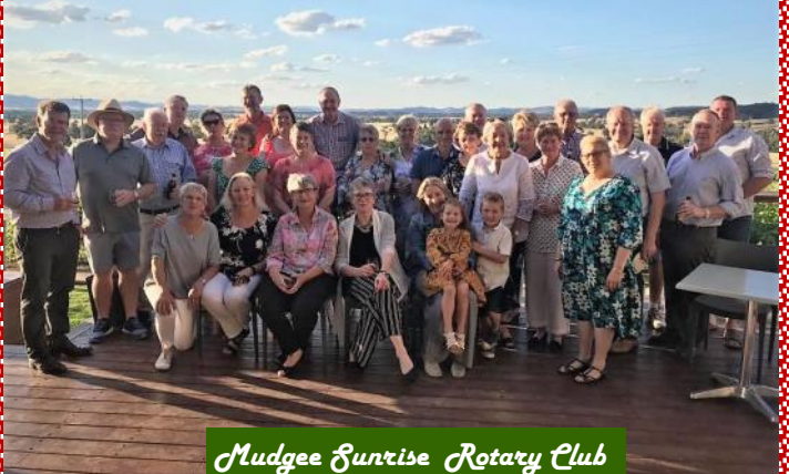
Mudgee Sunrise Rotary Club