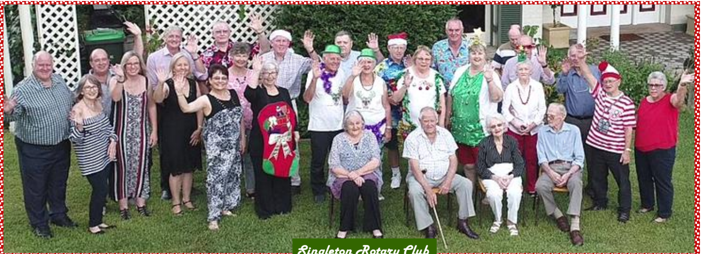
Singleton Rotary Club