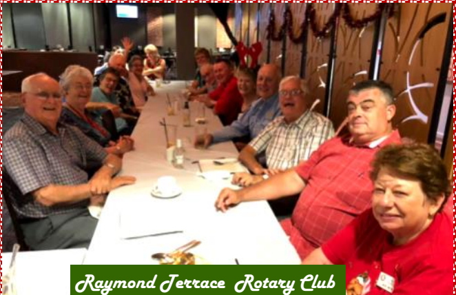
Raymond Terrace Rotary Club