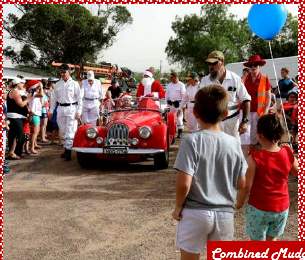
Combined Mudgee Rotary Clubs