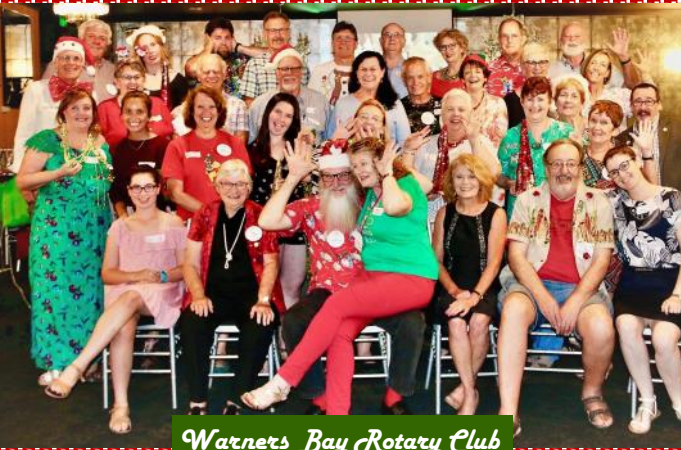
Warners Bay Rotary Club