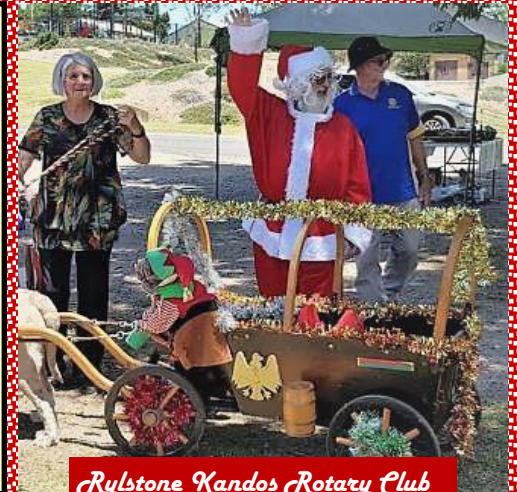
Rylstone Kandos Rotary Club

Collectively, 10,000 people attended the five events showcased on this page.