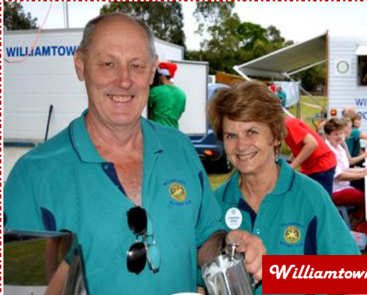
Williamtown Rotary Club