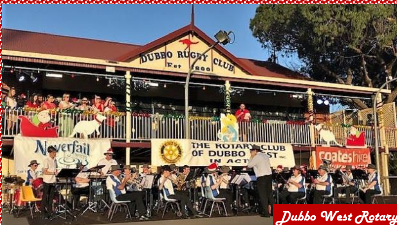
Dubbo West Rotary Club