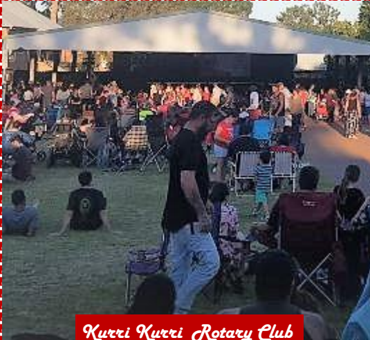
Kurri Kurri Rotary Club