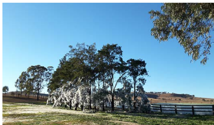
Frost on Golden Highway