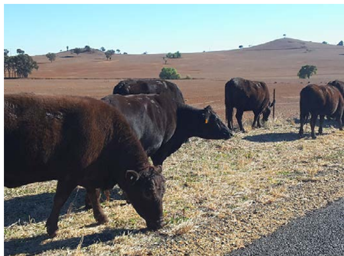
Cattle in the long paddock near Wellington

Moving into September which is Basic Education and Literacy Month, consider how you can assist your community with learning? Several Rotary Clubs offer literacy support within refugee communities or local primary schools? Have you considered running vocational mentoring days with your local high school? Encourage learning and support leadership amongst young people by connecting them to Rotary Programs such as RYPEN, MUNA, NYSF, and RYLA 1 .