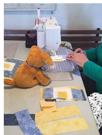
Puppy of Action - Scooby from Scone RC supervising preparations for Rotary fundraising

Keep an eye out for the dates of the next seminar in the District News.